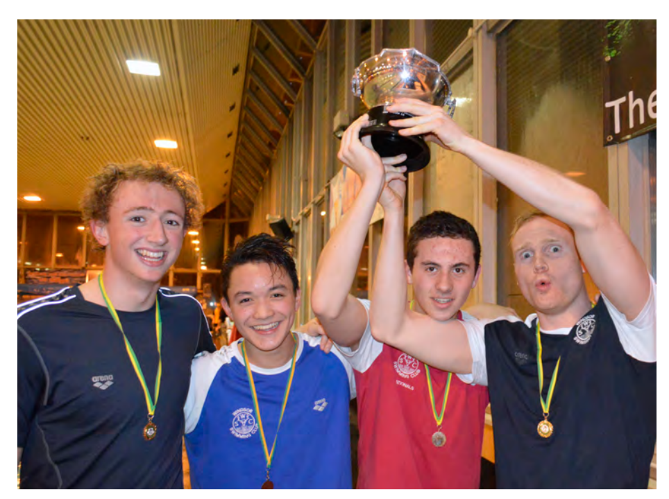
Mens Open 4x50 Medley LC Team Windsor A 1:51.84 (NCR) Wycombe District A 1:54.80 Bracknell & Wokingham A 1:55.52